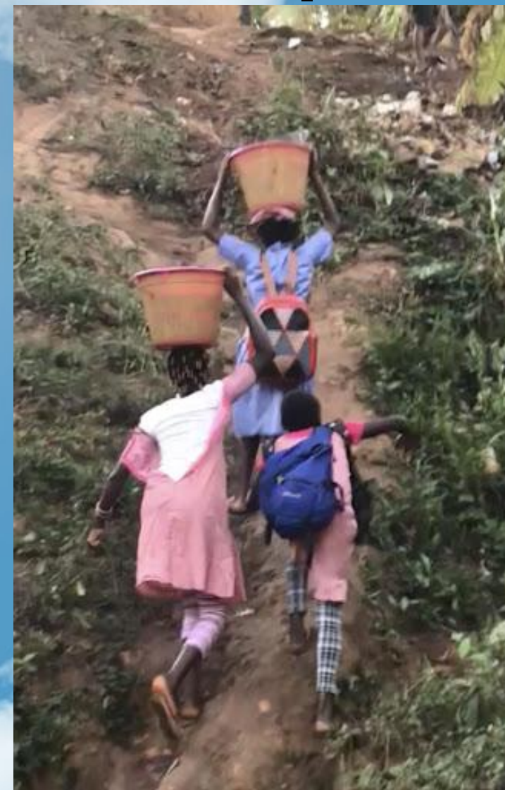
Daily Chore before School